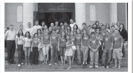
Delegates to the South American Lithuanian Youth Congress

As in the past, the Lithuanian Foundation accepts scholarship applications through March 15. Grant and media applications are accepted through April 15.