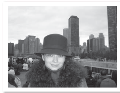
Sightseeing in Chicago